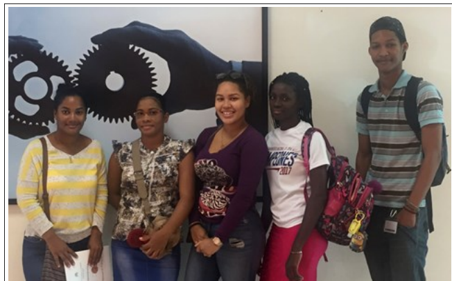
Five new ITSC scholarship recipients

Fondo Q is providing funding to the Instituto Técnico Superior Comunitario (ITSC), the only community college in the Dominican Republic, to cover the transportation costs of a select group of low-income students who have to travel long distances and take several buses/public cars to reach the college. Fondo Q is currently supporting about 30 students.