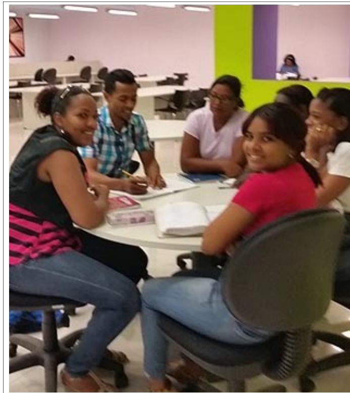
Students at the Instituto Técnico Superior Comunitario.

“ITSC is currently working with the Ministry of Higher Education, which is providing 621 students with scholarships for transportation, books, tuition, and food. However, another 600 students need scholarships to be able to attend.”