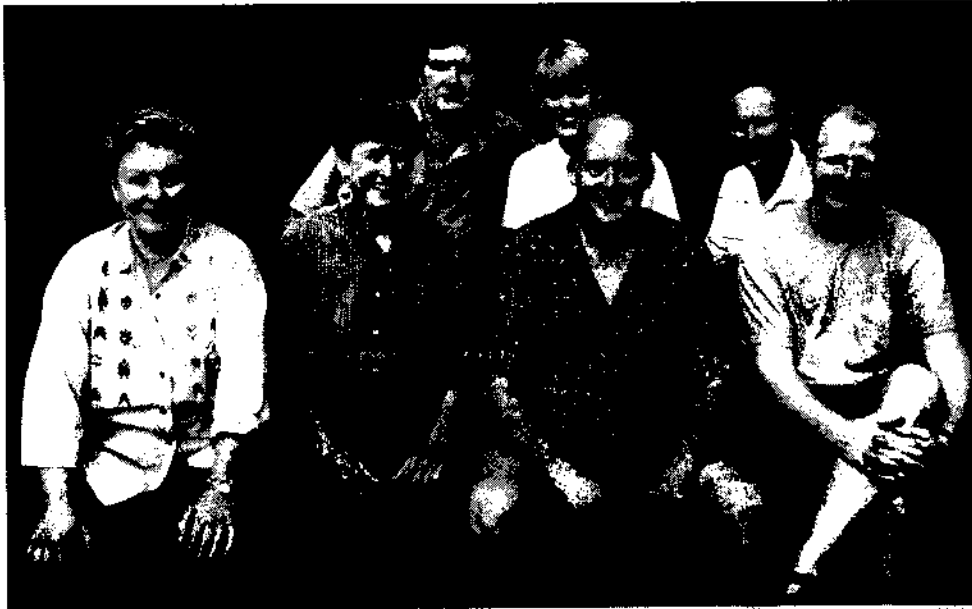
Fondo Quisqueya's current Board of Directors