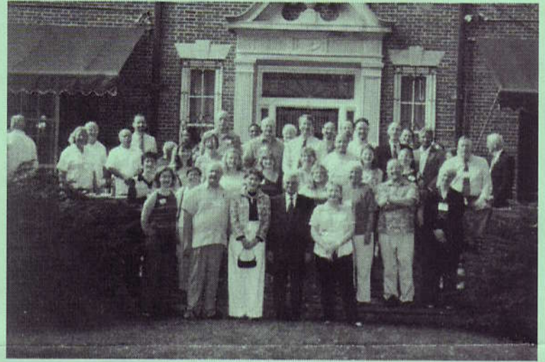
What is a P.C. event without a group photo?

We continue to fund scholarships for low-income Dominicans for technical vocational courses, and we support workshops and other educational activities.