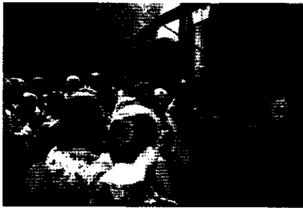
Reception at DR Embassy